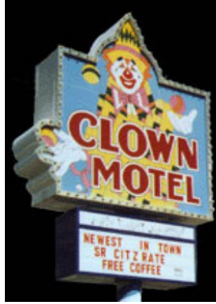
Our first night's lodging