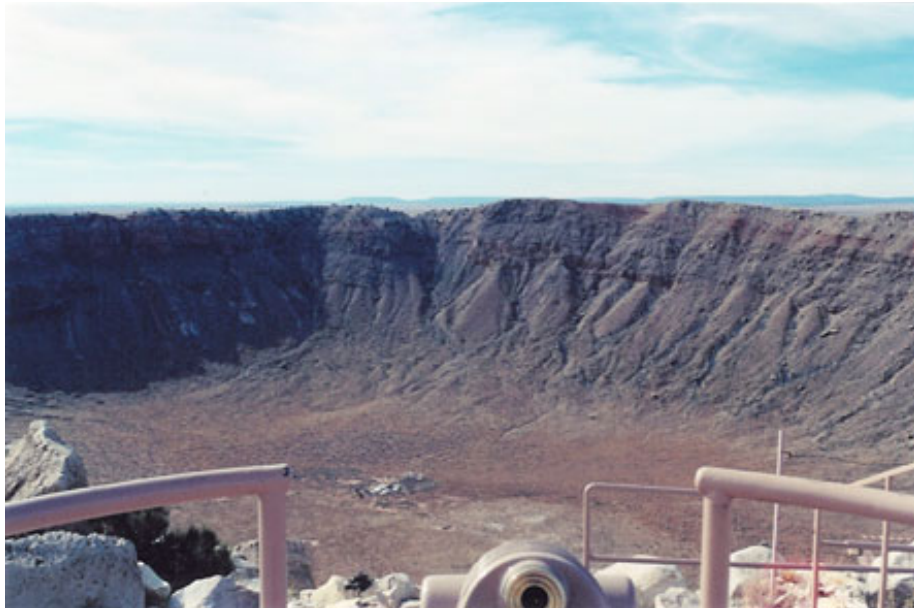
The Crater From The Highest Viewing Point

We set out from Flagstaff with our sights set on “Meteor Crater,” which is a short drive from there. The crater is quite impressive. Of course, the museum that accompanies the crater has a lot of info and it wouldn’t be a scientific exhibit without geologic columns with the myth of billions and millions of years thrown into your face. It would have been so much easier for them to just show the crater, some meteor fragments and leave it at that. The folks at the crater did the viewer the justice of leaving some things down at the bottom of the crater so that you can get an idea about the enormity of the hole. Life size human figures are even hard to see with the tourist telescopes that are mounted all over the place.