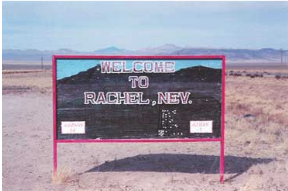
Rachel – Where I'd like to retire someday

demonic origin, but I swallowed my probable misdirected caution and went in. I was hungry and wasn't going to let a few little Grey buggers ruin what was a wonderful breakfast.