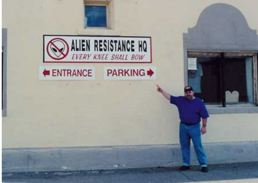
Me Standing outside the hallowed halls of ARHQ

We walked around the streets of Roswell for a while, noticing how the town had given itself over to the UFO Delusion. Most of the streetlamps downtown had big black alien eyes painted on them. There were several souvenir shops that catered to alien stuff. I was not surprised to see that almost all the souvenir shops had occult articles in them as well as alien merchandise. Anyone who has seriously studied the UFO following knows that they and the occult are one and the same. It's like bread in the bread isle, different packaging but the same ingredients.