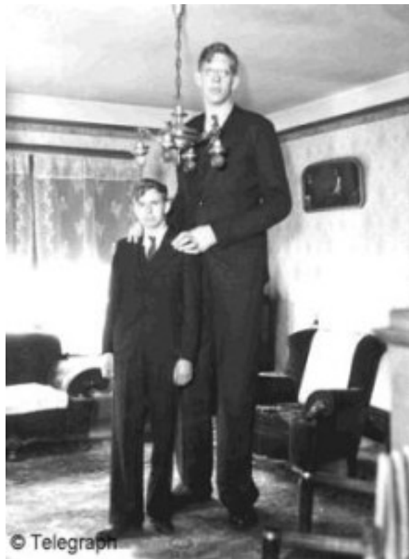
Picture of Robert with his brother

While attending college, Robert also worked for a shoe company, travelling to show the immense shoes that they had made for him. His great height and weight – nearly 500 pounds – caused health problems; he required leg braces to walk, and, due to the unusually long-distance nerve impulses had to travel, had difficulty feeling any sensation in his feet. Because of this, he failed to notice pain from an infection caused by a poorly fitting leg brace. He died of this infection on 15 July 1940, at the age of 22.