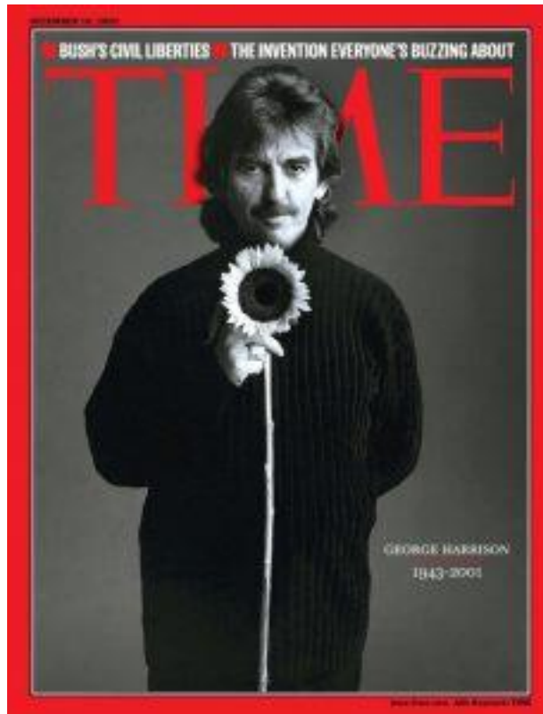
Time Magazine cover. December 10, 2001

Upon his death, Time magazine published this telling photo of Beatle superstar George Harrison (1943-2001) on the cover of its December 10, 2001, issue. Harrison, wearing black, in a black and white photo, holds a sunflower, symbol of the Illuminati Sun God. The solar deity is also prominently worshiped in the Hindu religion and the Beatles were devoted followers of the Maharishi Mahesh Yogi and other Indian Hindu gurus. Time's feature story, in fact, reports that George Harrison never gave up on his gurus, to his dying breath. All the Beatles were drenched in illegal drugs, such as cocaine, hashish, and heroin. Their album, Sergeant Pepper's Lonely Hearts Club Band, even had a cameo photo of British "666" beast Satanist priest, Aleister Crowley, on its cover. The latest information is that the Beatles were an experimental music group sponsored behind the