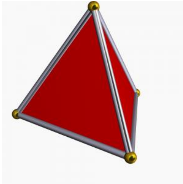
Image by Robert Webb's Stella software at website: http://www.software3d.com/Stella.php .

Simplex – This word is a combination word. It describes a word that can evolve into another word. To put it in simple terms, Simplex is defined as something simple that can change when other dimensions are added. The image below can best explain what is meant here.